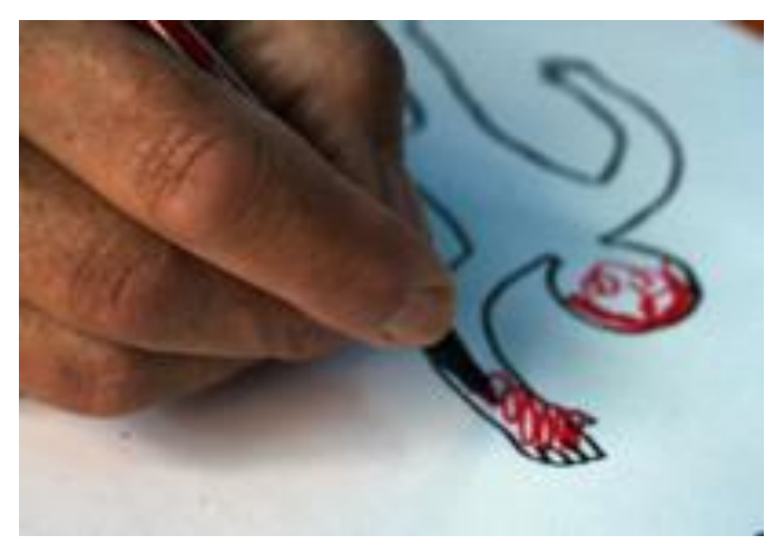
Figure 1: Doing a language portrait